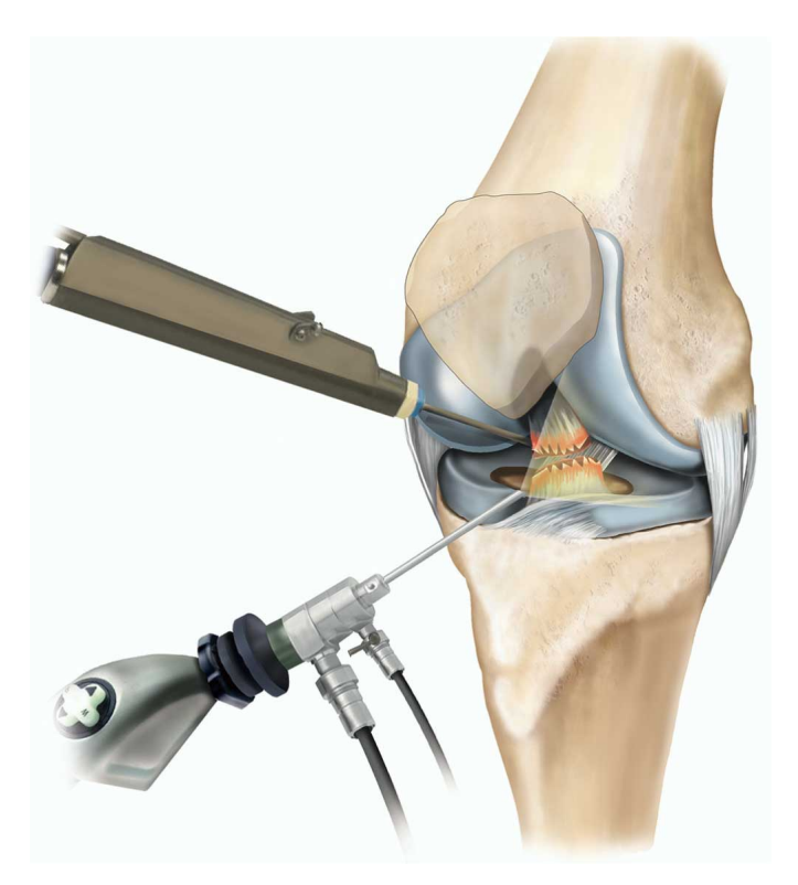
An arthroscopy of the knee

If you have torn your anterior cruciate ligament (ACL), you may need a reconstruction operation. This is a larger procedure but it can often be performed by an arthroscopy. Your surgeon will discuss this with you beforehand.